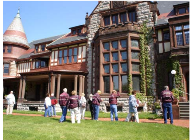
As we admire the architecture