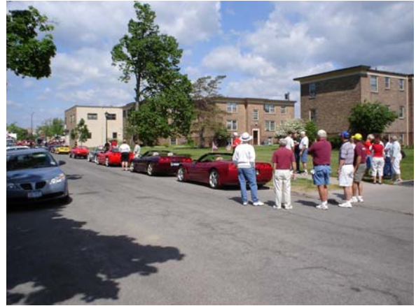
Staging For The Parade