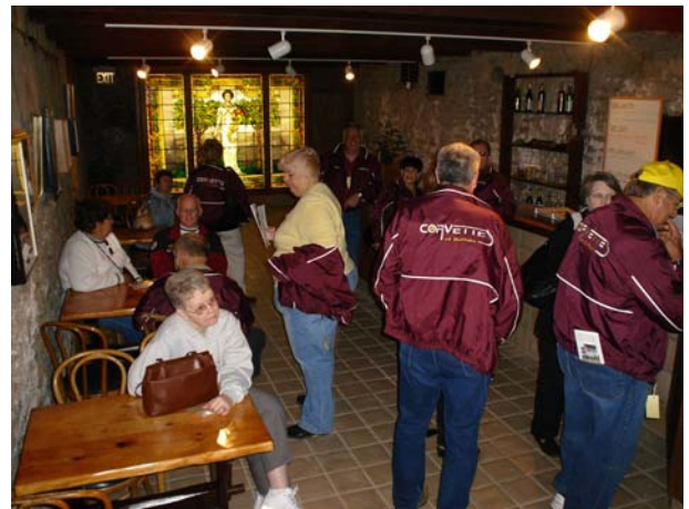
The best part WINE TASTING