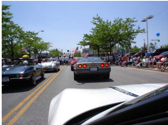
On Delaware By Paddock's