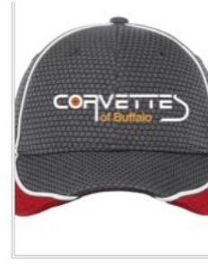
GO MESH HAT $19.00