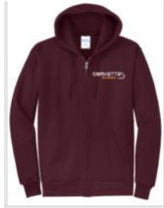
GO FULL-ZIP HOODED SWEATSHIRT $32.00 - $34.00